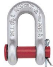
G-215 / S-215

G-215 Round pin chain shackles meet the performance requirements of Federal Specification RR-C-271F Type IVB, Grade A, Class 1, except for those provisions required of the contractor. For additional information, see page 468.