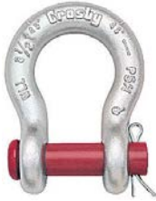
G-213 / S-213

G-213 Round pin anchor shackles meet the performance requirements of Federal Specification RR-C-271F Type IVA, Grade A, Class 1, except for those provisions required of the contractor. For additional information, see page 468.