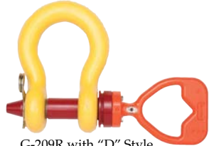
G-209RP with "D" Style Handle Shown